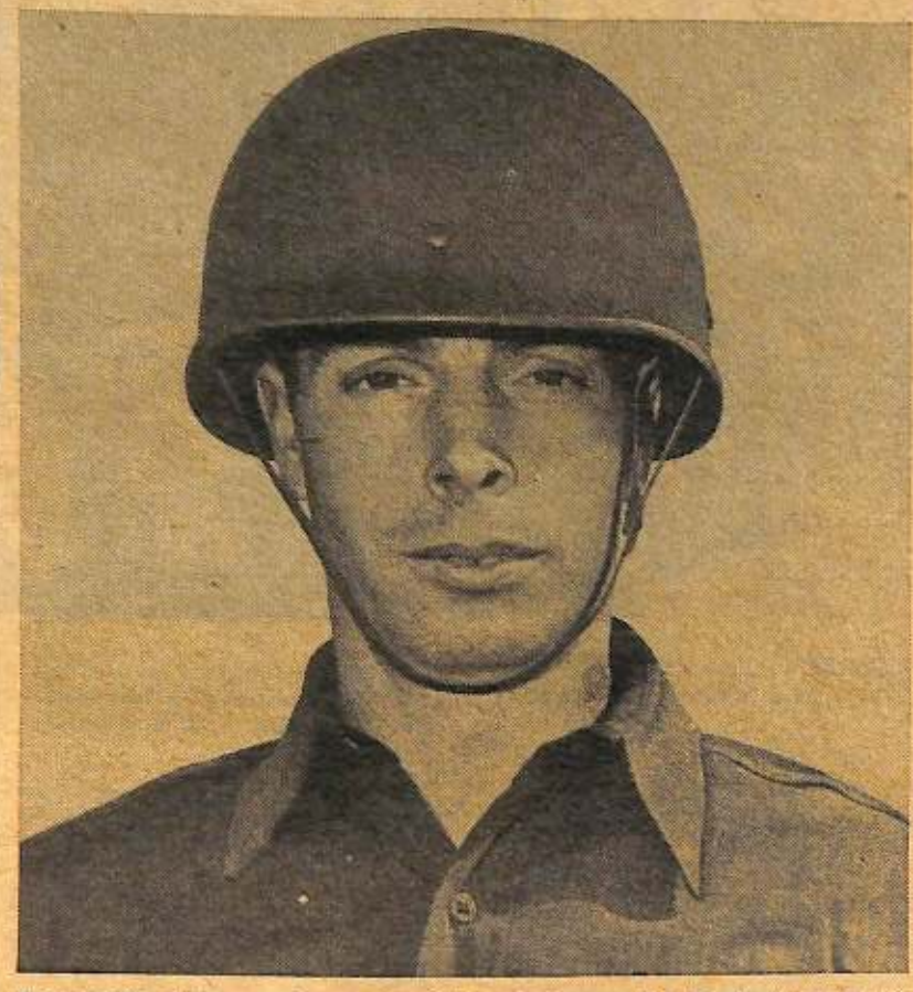
Former Yankee powerhouse Joe DiMaggio is now Pvt, Joe in Uncle Sam's army. The former star outfielder recently traded his $50,000-a-year baseball uniform for a $50-a-month khaki outfit.