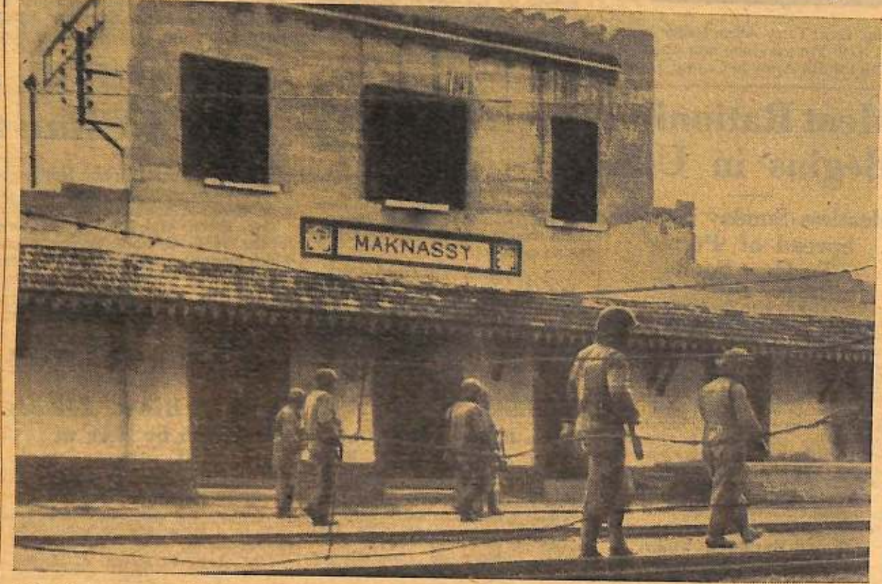
U.S. infantrymen cautiously approach the deserted railway station at Maknassy, central Tunisia, captured a week ago by American columns which today have moved ten miles east of the town to the coastal plain protecting Rommel's only line of retreat from the south.