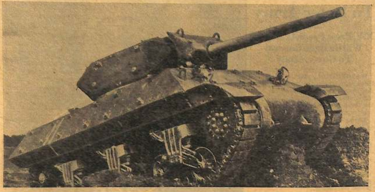
This is a new U.S. tank destroyer whose battle mission is to seek out and demolish enemy armed vehicles. Called the M-10 in Army technical manual, it is heavily armored and faster than the ordinary tank and carries heavy firepower. It already has been tested in battle.