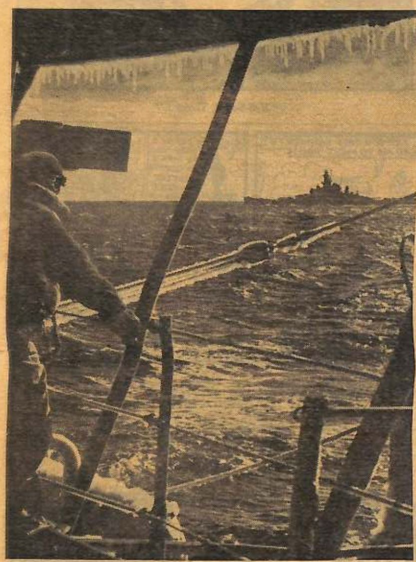
Silhouetted against the cold, grey sky somewhere on a wintry Atlantic, one of the new U.S. battlewagons steams along on a mission. This picture was taken from the deck of an accompanying ice-trimmed destroyer.