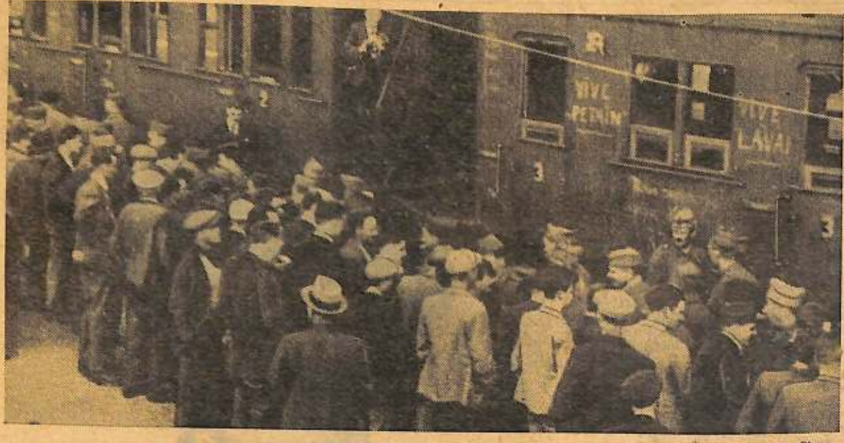
Outside a railway station at Compiegne, France, during the Fall of 1942, laborers await shipment to Germany, where, as a result of Hitler's slave labor society, one out of seven workers is from conquered territory or from Germany's satellite allies.