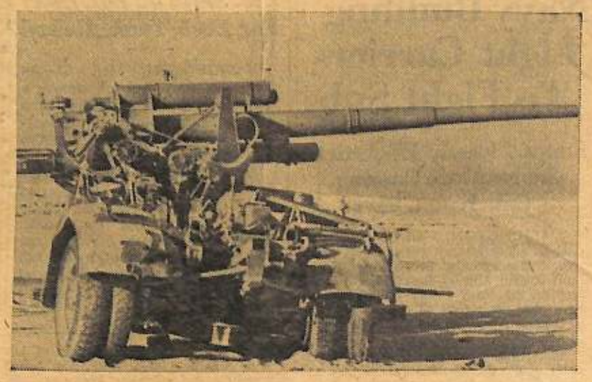
a healthy respect for this Nazi weapon Axis tanks and took 200 prisoners.

This is the famous German 88mm. In the picture below, an American anti-aircraft, anti-tank gun (above), sentry stands guard over a group of knocked out after the Afrika Korps Italian soldiers captured near El gave way to recent Allied thrusts on a desert battlefield in central Tunisia a battle last week, when the U.S. Wounded returning from Africa tell of Fifth Army destroyed 35 to 40 a healthy respect for this Nazi weapon.