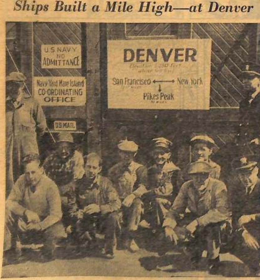
At exactly one mile above sea-level in the Rocky Mountains, 1,297 miles from San Francisco, the U.S. Navy is fabricating portions of destroyers and shipping them to west coast ports from Denver steel mills. Here, Naval officers and these Rocky Mountain shipbuilders pose outside the factory from where ships go down to sea by rail.