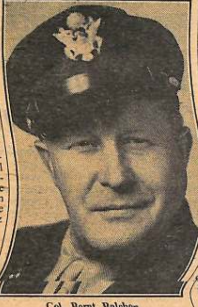
Col. Bernt Balchen

supplies or men squarely into the chosen