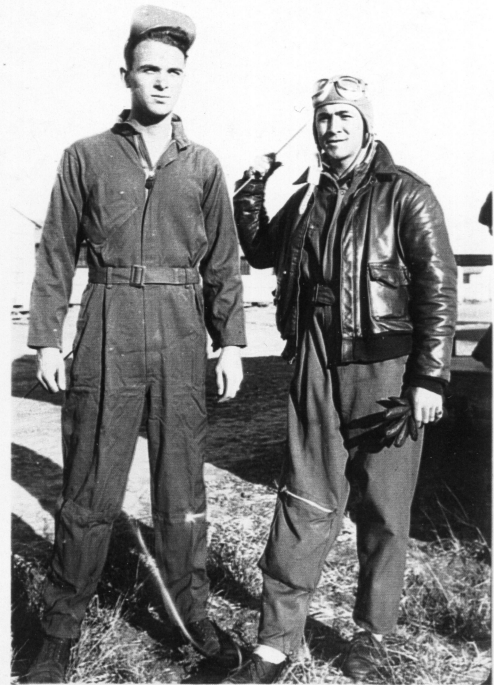
KEARNEY AAB - NEBRA. 1943