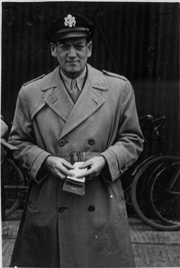
Glenn Miller, Capt. U.S. Special Forces 306 Bomb Base, Thurleigh, Eng. July, 1944

The popular Miller Band regularly broadcast on the BBC from the Corn Exchange in nearby Bedford (5 miles from Thurleigh). On several occasions made their broadcasts from a hanger at our base.