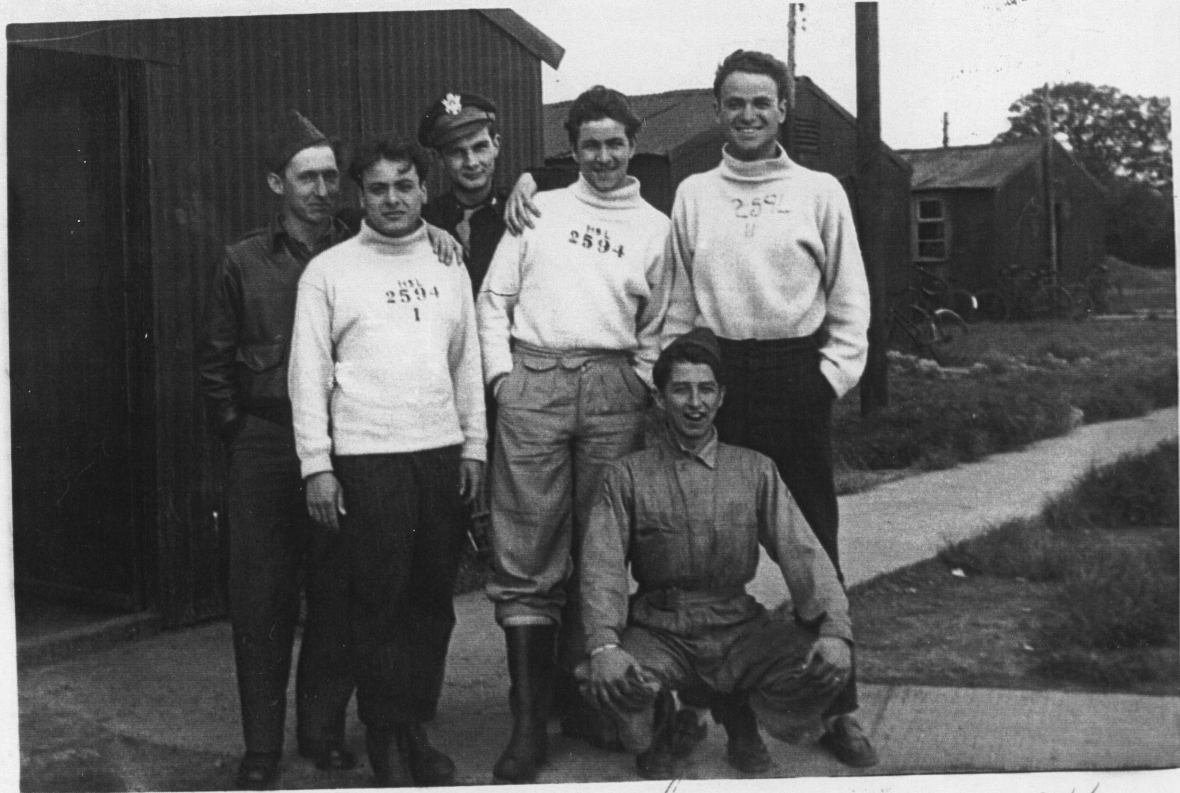
Neptune's wayward sons - May 17, 1944 Happy to be "home" after Sea & Air rescue.